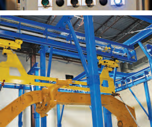
Spurs throughout the system allow for parts to be pulled offline and re-entered into the system.

Companies also can customize the layout of the conveyor system with turnarounds, which can remove products from the flow for extra processing and then merge them back into the main line—similar to a three-point turn in a vehicle. It also can be used with current equipment, new equipment or an integrated combination